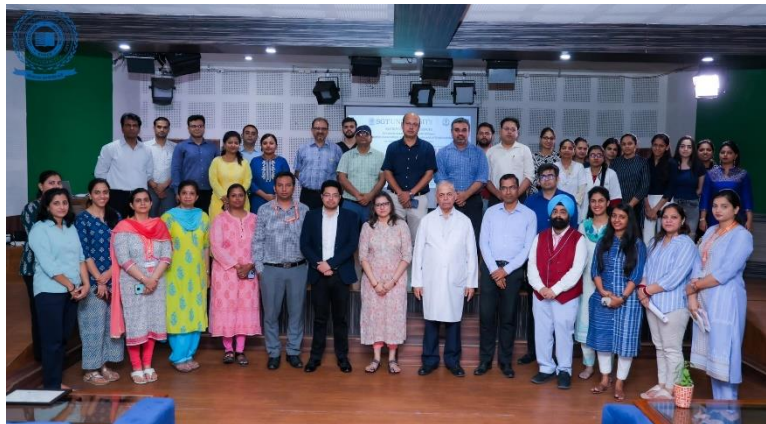
Group photo with the speaker during the inauguration ceremony